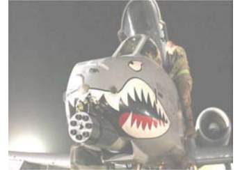
One warplane less